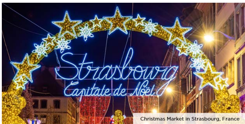
Christmas Market in Strasbourg, France