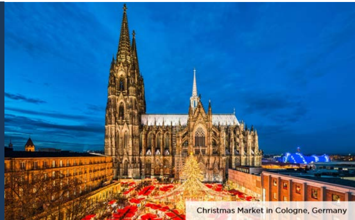
Christmas Market in Cologne, Germany

7-night cruise from Amsterdam to Basel December 5-12, 2022 | AmaMora